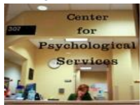
The 6-week summer program will take place from June 18-August 1, 2014.

Marquette is committed to meeting the needs of urban and underserved communities. The Health Careers Opportunity Program's Summer Enrichment Program in Behavioral Health is intended to provide undergraduate students from minority and disadvantaged backgrounds with an opportunity to explore the field of clinical psychology in order to become more competitive for admission to and success in graduate school.