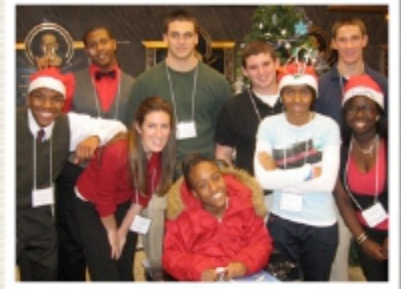
DREAM LEADERS VOLUNTEER AT HOLIDAY FOR HOPE

Paying It Forward- Dream Leaders that have excelled in the other two areas are invited back to Conferences as Junior Facilitators. As Junior Facilitators, they lead workshops and discussions to pass on what they have learned about making a difference to other teens.