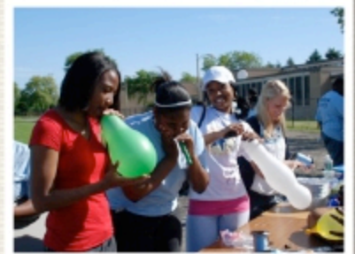
DREAM LEADERS AT HARLAN RAISED $545 AT A SCHOOL CARNIVAL