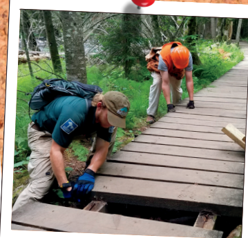
BUILD TRAILS + BRIDGES