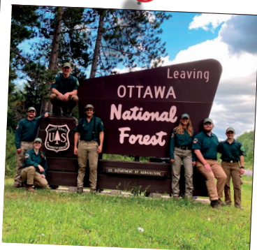
USFS TECHNICIANS HIAWATHA + OTTAWA