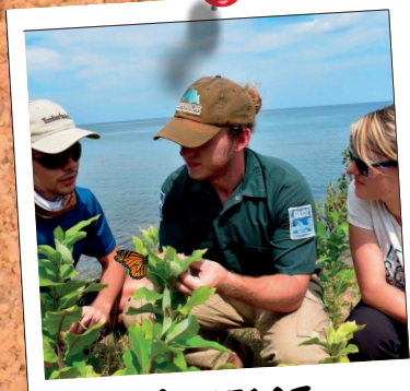
RESTORE NATIVE HABITAT