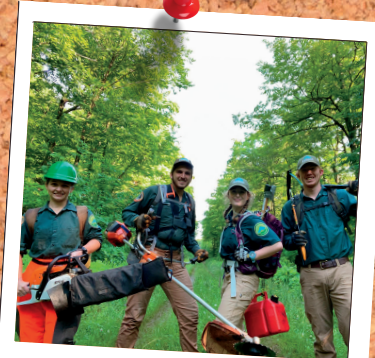
WORK AS A TEAM