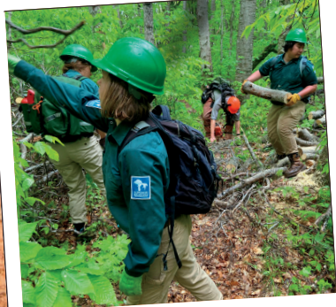
GREAT LAKES CLIMATE CORPS