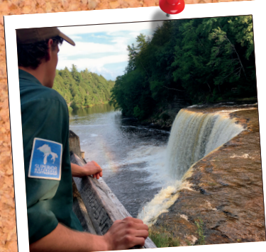
EXPLORE THE UPPER PENINSULA